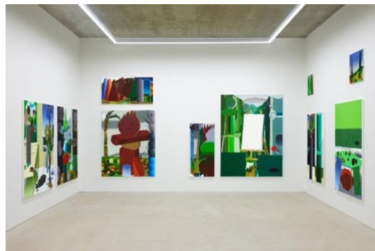
(Right) Hyunsun Jeon: Gallery2, Seoul "Meet Me in the Middle" (July-August 2022), Installation in Courtesy of Gallery2

*Schedules may change due to regulations for coronavirus and transportation etc.