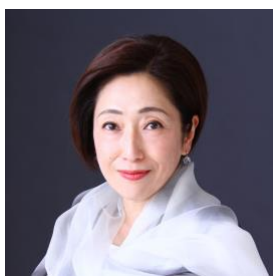
Architect, President & CEO, Daio Co., Ltd.

We hope that Fukuoka can become a special place to host the leading art fair in Kyushu and Asia.