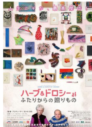
Copyright © 2013 Fine Line Media, Inc. All Rights Reserved.