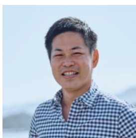
President, Aura Contemporary Art Foundation

It is an opportunity to dive in and get lost in the sea of messages and absorb the energy of the artists through your skin. Imagine the space you want to immerse yourself in and then let's go on a journey together!