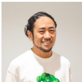
CAMPFIRE, Inc. CEO

We would like to introduce three supporters here in this second press release (listed in Japanese alphabetical order)