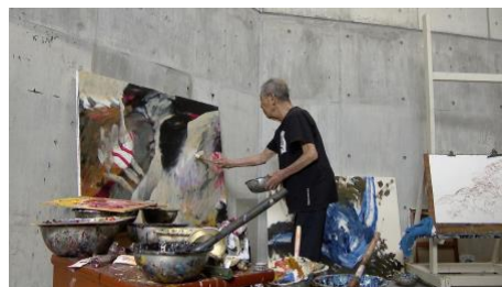
『Egakitsuzukete 100sai~Gaka Nomiyama Gyoji』