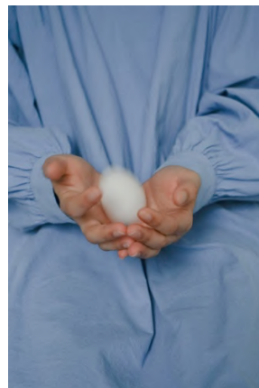
Thor Souen, Holding #2, 2024 Photo acrylic, 28 x 42cm A live performance will be held during the art fair.