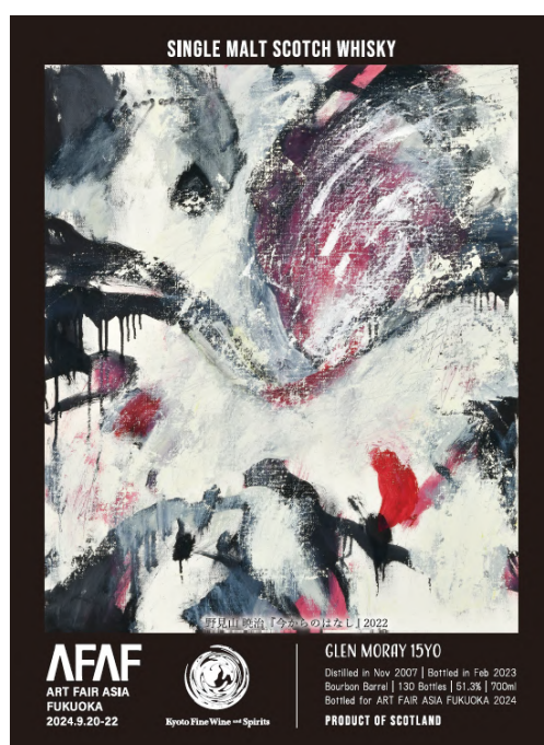
AFAF Private Bottle Series #1 (2024) Gyoji Nomiyama, Glen Moray, 2007 700ml

The limited edition consists of 130 bottles and will be available for pre-order on a special page of the AFAF official website in late August, as well as at the “Bar Higuchi x AFAF” corner which will be set up at the entrance of AFAF.